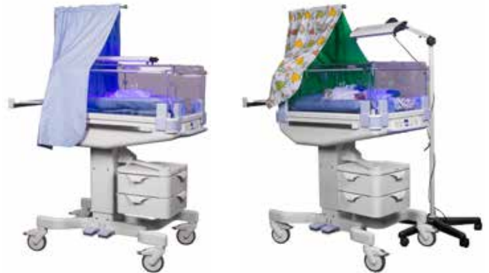
Sample applications with Lifetherm warming bed